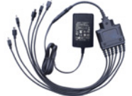
6-Unit Switching Power (Combine w/ CH05L01) PS4001