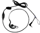
Earpiece with In-Line MIC, PTT, & VOX EHS09